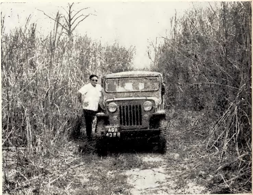
Above : A census party in Kaziranga crosses a bil covered with water hyacinth. Below : One of the cold weather jeepable roads inside Kaziranga